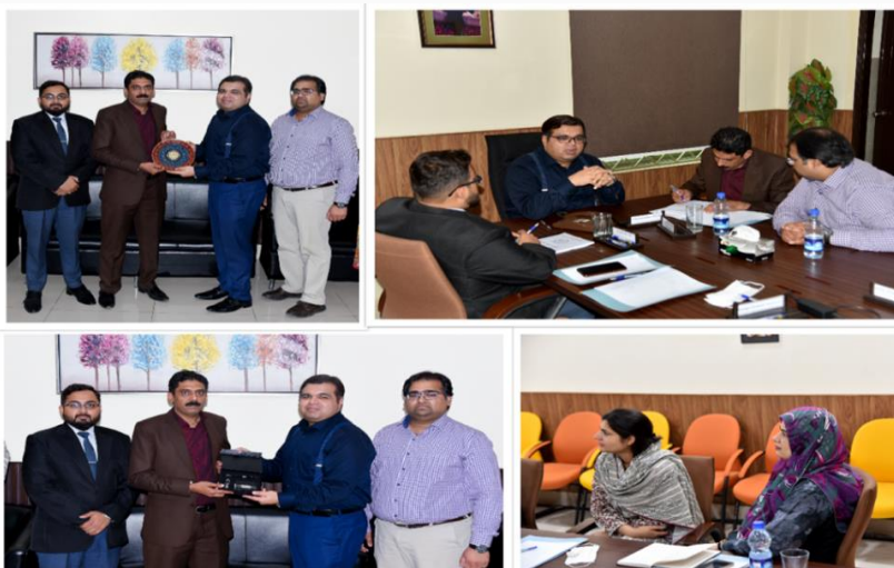
Assessment Team (AT) visit for the External Evaluation of MS-MSKPT program

The review conducted by the DQA, and the External Subject Expert has provided valuable insights that can help the MS MSKPT program at FUCP enhance its educational quality, which will ultimately benefit its students.