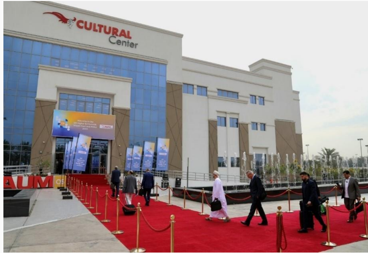
S Summit Venue - Cultural Center, American University of the Middle East (AUM), Kuwait