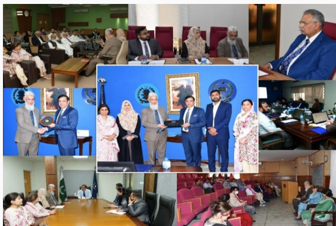
Team Visit for the Evaluation of Self-Institutional Performance Evaluation (IPE) - 2023

At the conclusion of the IPE, the panel members shared their recommendations with the DQA. The DQA will use these recommendations to prepare compliance reports for the university to ensure that the university meets the established Quality Standards.