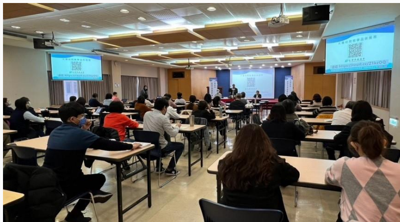
TWAEA's Briefing Session on the 2023-2027 "Higher Education Quality Certification Project"

TWAEA, as a professional quality assurance agency, hopes to provide practical and constructive suggestions to the evaluated institutions through a solid quality assurance framework, so as to continuously assist the teaching units of each institution to foster teaching quality and self-improvement, and create a more sustainable future for higher education in Taiwan.