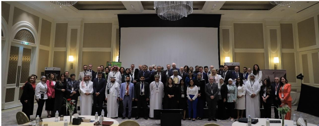
The gathering at the award function held on 9th March 2023 at The Address Boulevard, Dubai – UAE